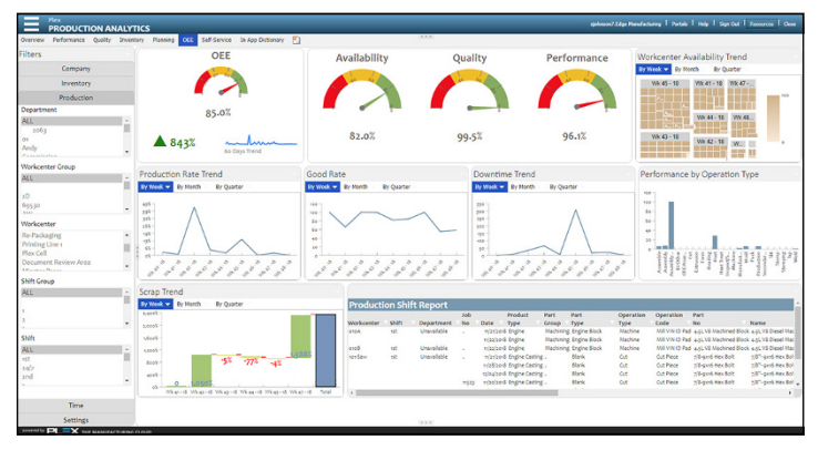
FIGURE 4-4: An MES dashboard.

For operations managers, these dashboards might include metrics showing the quantity of parts produced, the production time for each part, equipment downtime, scrap, the time for total production, the quality of the produced parts, the number of parts with issues, the time spent by the operator, and the associated cost.